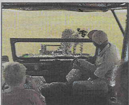
OUT OF AFRICA: Kenya game-spotting

A little over four hours from Britain, Marrakech is the quickest way to get a taste of something very different. The Berber city offers an exotic mix of souks, kasbahs, mosques, palaces – and the ochre-coloured streets of the medieval medina – all dramatically lit by a radiant North African light. Head to the wonderfully chaotic Djemaa el Fna, the square at the centre of Marrakech, which at night turns into a playground filled with snake charmers, soothsayers and magicians. Stay at a stylish hotel or more traditional riad within the walled city. Trips and treks into the snowy High Atlas mountains