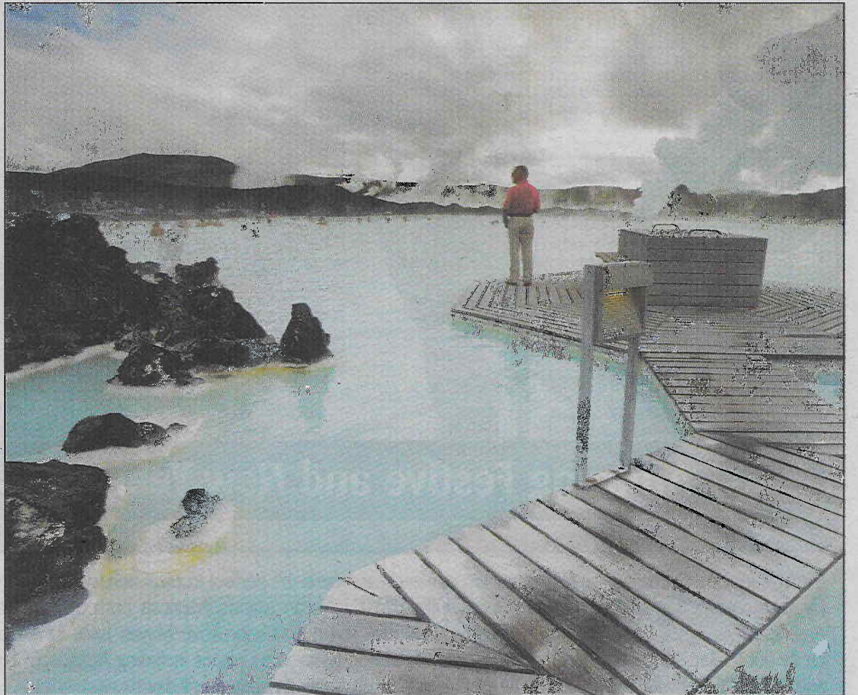
HOT STUFF: The Blue Lagoon mineral-rich geothermal spa is one of Iceland's most-visited attractions

For the ultimate cultural weekend, fly to Cairo and visit the Pyramids – it's surreal to head to these ancient monuments located on the outskirts of the modern city. Visit one of Cairo's bazaars and the Museum of Egyptian Antiquities, which houses the incomparable funerary treasures of the boy king Tutankhamun and the famous Royal Mummies. Then fly down to Luxor, and travel in caleshes (horse-drawn carriages) to the unmissable ancient masterpiece of The Karnak Temple, and don't miss the Valley Of The Kings. Trips down the Nile in a